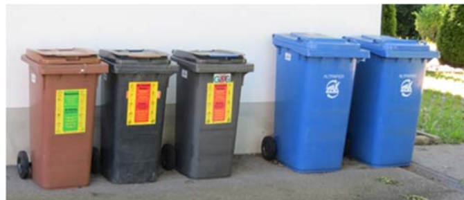
Bio waste – residual waste – paper & board for recycling