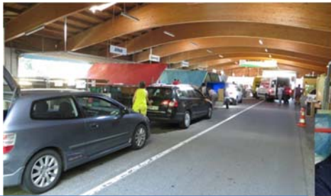
Resource yard (recycling yard)

Quality control and/or sorting upon receiving!